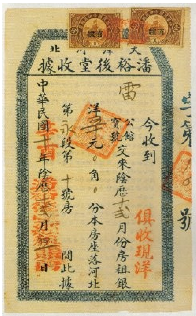
This Chinese private issue note of 1 yuan dates from 1921. It was issued in Honan province and bears two 1 fen postage stamps on its obverse. The purpose for this is not known.