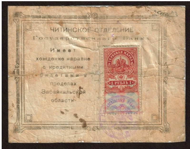
The White Russian stronghold of Chita in Eastern Siberia used tax stamps affixed to pre-printed forms to create their own stamp-money.