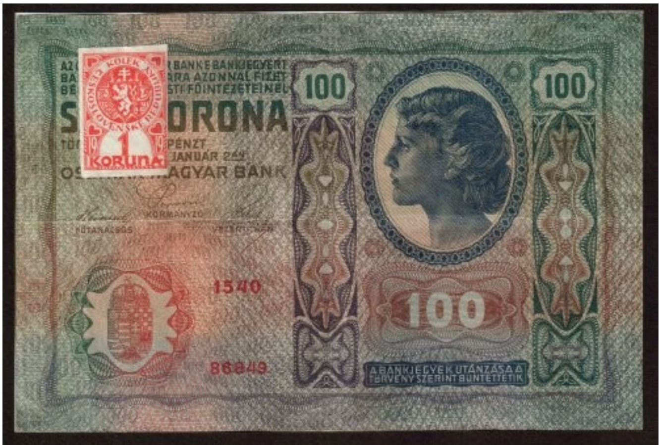
The 1 koruna stamp when affixed, after World War I, to this former Austria-Hungary 100 kronen issue, transformed it into Czechoslovakia's first currency. This was an expedient used until bank notes for the newly formed Republic of Czechoslovakia could be printed and distributed.