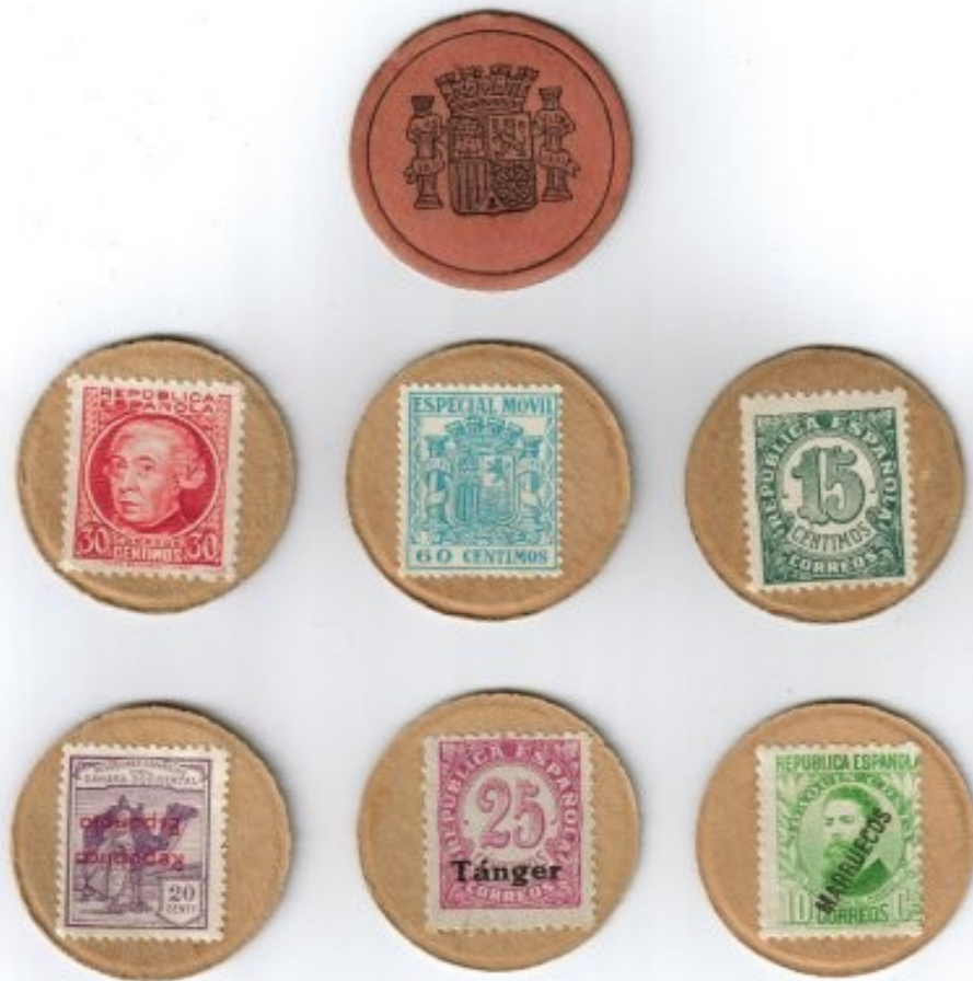
Spanish Civil War Postage Stamp Money. Both postage and tax stamps were affixed to the cardboard disks. This practice spread to Spain's colonies in Africa such as Tangier, the Spanish Sahara and Morocco.

During the Spanish Civil War, the Republic also issued postage stamps as money. In this case, the issue was regulated in quite a different manner. The government printed small brown disks from cardboard with the Spanish crowned arms impressed on one side. These disks were given by the banks to all persons who wished to have them. In this manner each individual could attach a current stamp to the reverse of the disk thereby creating the value desired. Therefore, many stamp varieties and values may be found on these disks. My collection contains the following examples: 5, 10, 15, 25 centimos (N. Salmeron); 25, 30, 50 centimos (Conception Arenal); 40, 50, 60 centimos (Jovellanos with "Republica Espanola"); 5 and 25 centimos (value in oval); and 5, 10, 15, 50 centimos (coat of arms).