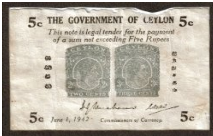
Emergency issue of Ceylon to relieve a shortage of coins.