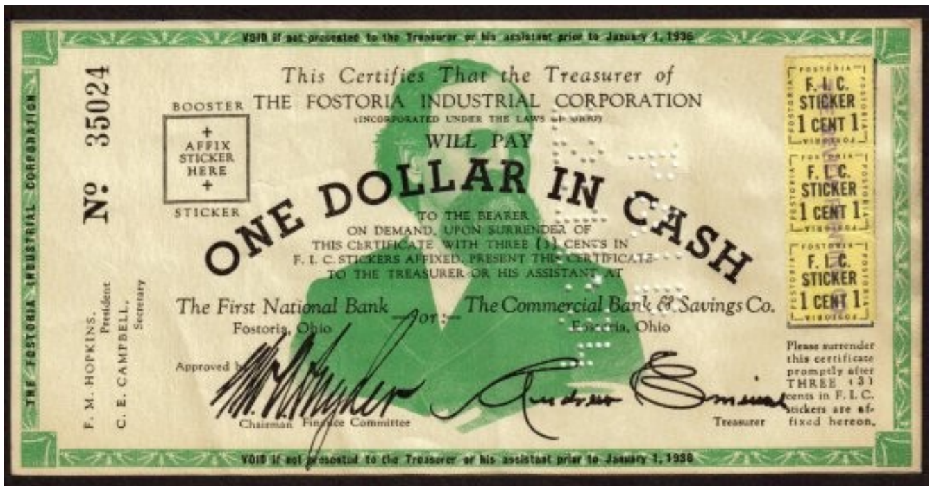
American "Depression Scrip" note from Fostoria, Ohio with three one cent "booster" stamps attached.

value plus expenses. When the bearer presented the note for payment, the issuer had to redeem it and pay out its face value, but he had remaining the interest on the whole for fifty-two weeks! "Dwindling money" was issued in other countries as well. There existed, and still exist, issues in France, Austria, Sweden and Brazil. From 1933 on through the depression a great number of issues existed in the United States. I am astonished that these notes are not collected in the United States today. During the 1930s I received some of these notes for my collection, but now since many years, no more.