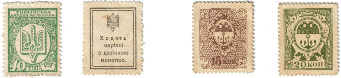
The government of the Ukraine, after gaining independence, circulated its own stamp-notes (left); while the city of Odessa issued their own (right).