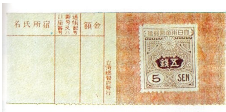
Korean postal stamp issue of 1917.