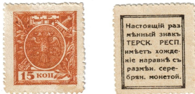
Terek Republic stamp-money in the amount of 15 kopeks.

The use of tax stamps and control stamps on bank notes became prevalent in the eastern provinces of Russia during the revolution. Well known examples are the issues of the subsidiary banks of the state bank of Chita. Chita was for some years the capital of a