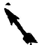
Exhibit A of 1

Note: Certificate of officer authorized by law to take acknowledgments is not essential to the validity of Notice of Federal Tax Lien. Rev. Rul. 71-466, 1971-2 C.B. 409. Part 2 - To be signed and returned to the Internal Revenue Form 668-F (Rev. 2-85)